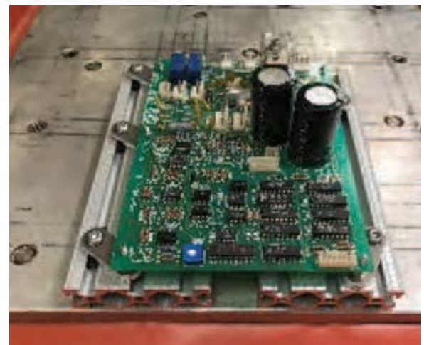
Optional PCA fixture kits are easy-to-use mounting hardware for your electronics to the table.