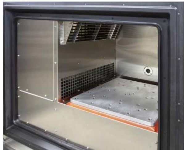
18"x18" vibration table with Qualmark repetitive shock technology.

*Ramp rate and gRMS are measured at the table with an empty chamber.